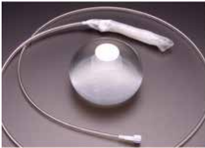
Intragastric Balloon Lex-Bal