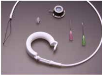
Lexel Gastric Band